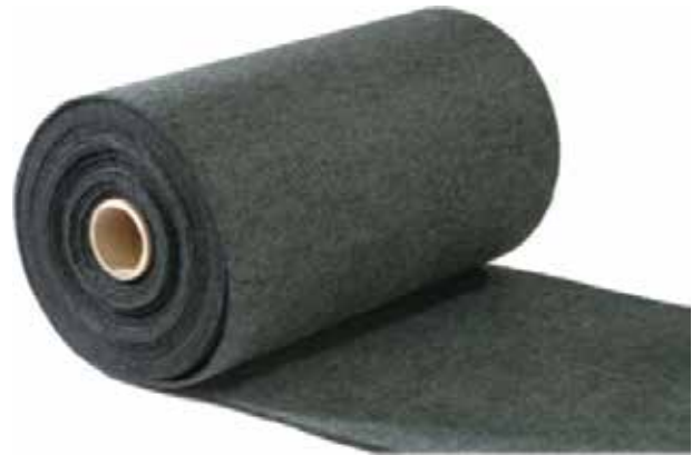
CarbonWeb®250 gsm Virgin Coconut Shell High Activity Carbon Gas & Particulate Media